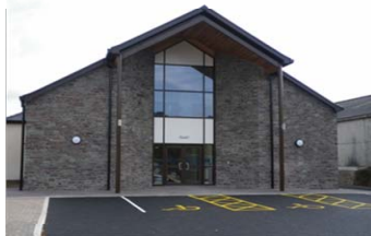
Elim Church, Canal Road Brecon

J.L. Stephens Ltd completed another major project in Brecon in early October 2011 - the new £1 million church for Elim International.