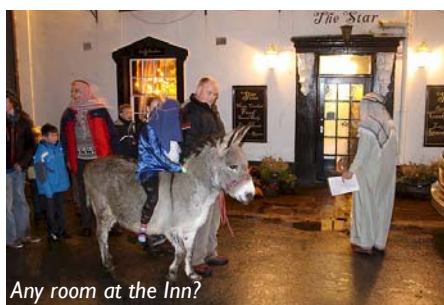
Any room at the Inn?

This Spring term there will be a Mothers' Day service for all in the Henderson Hall at