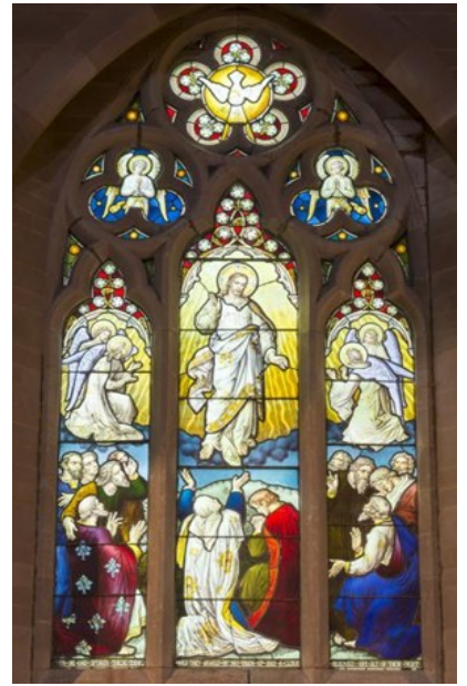
The altar window at Llansantffraed, The Ascension (Ward & Hughes, 1885)