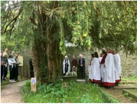
Ceremony at the graveside of Henry Vaughan